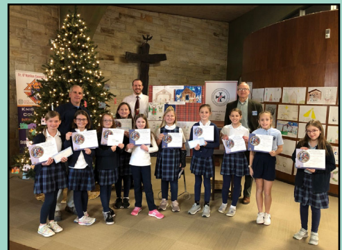
K of C Poster Contest Winners