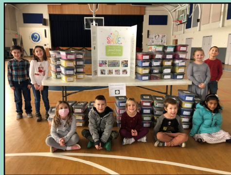
CCD Advent Jared Box Project

January 7 & 8, 2023 The Epiphany of the Lord