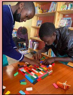
Students in Rwanda learn using toys and games from CDA.