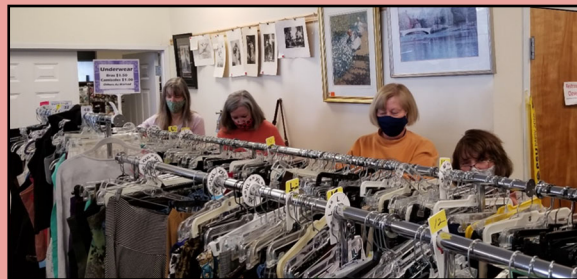
Volunteering at SVDP Thrift Store

September 17 & 18, 2022 25 th Sunday in Ordinary Time