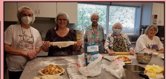
Pie Baking for bake sales and pie sales.

Catholic Daughters of the Americas "Meet and Greet" Sunday, September 18 at 2:00pm - OLV Activities Center Gardiner Social Hall. We are involved in many charitable activities. Come and see what we are all about!