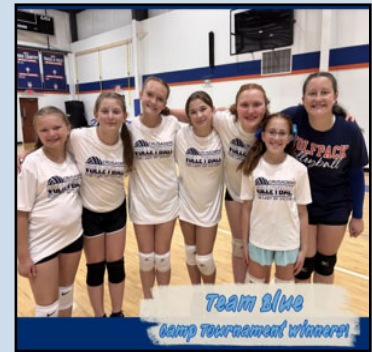
Team Blue camp tournament winners