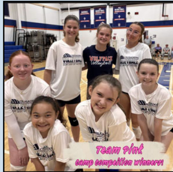
Team Pink camp competition winners

June 27 & 28, 2026 13th Sunday of Ordinary Time